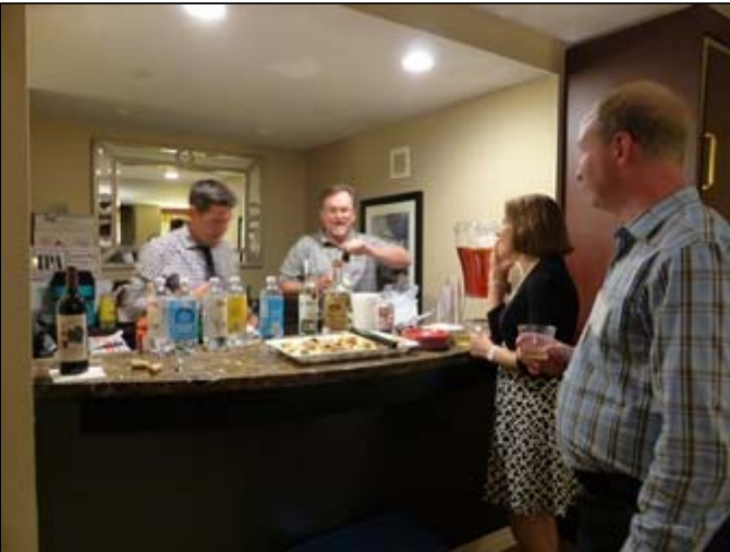
The Self-Serve Hospitality Suite Bar