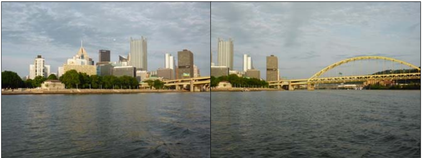
View from the Ohio River with the Fort Pitt Bridge Carrying Interstate 376 Traffic