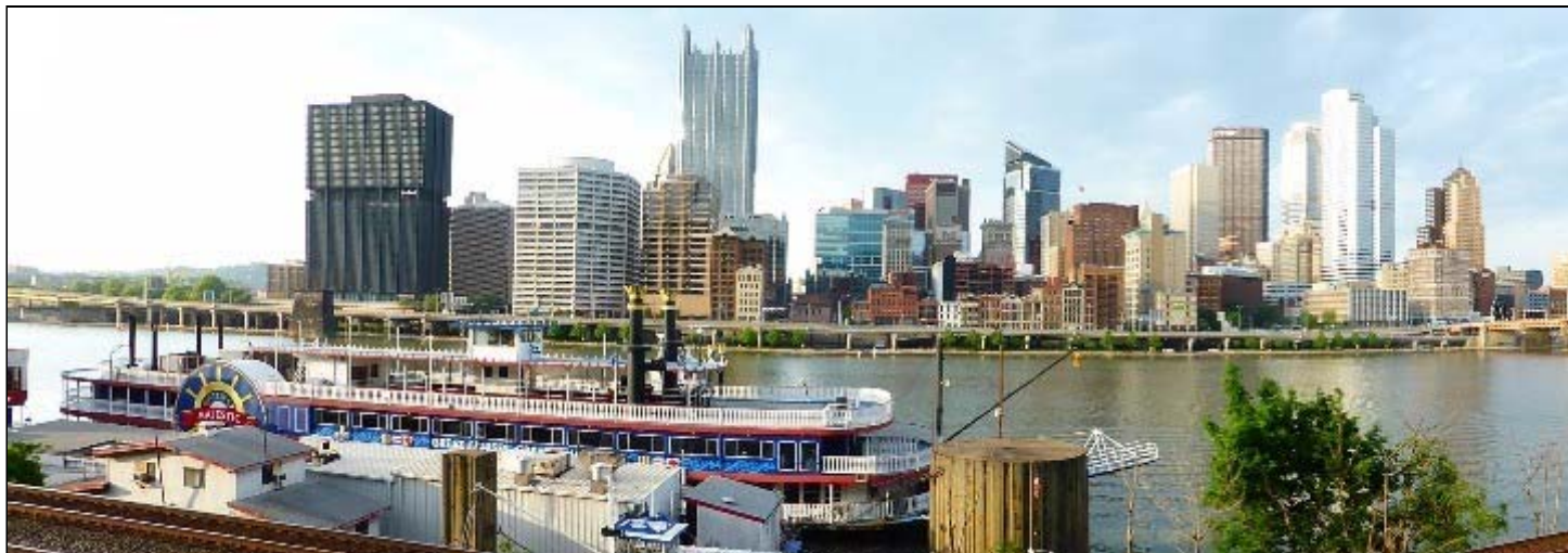
Spectacular View of Downtown Pittsburgh Skyline from Hotel Breakfast Veranda