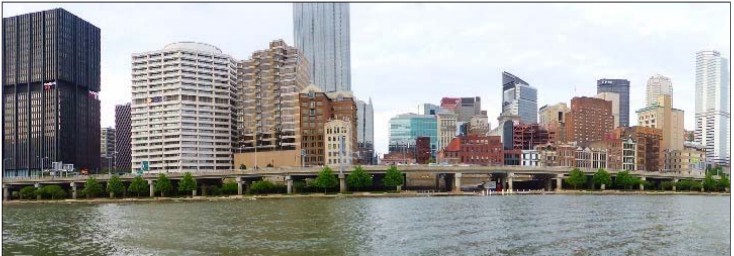
Another Fantastic View of the Pittsburgh Skyline