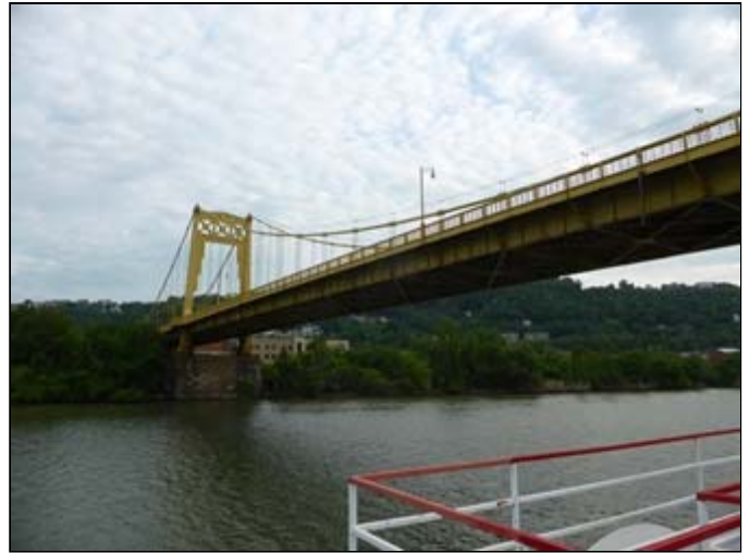
Bridges Everywhere, All Unique. You Haven't Seen Pittsburgh Until You've Taken a Cruise on the Three Rivers.