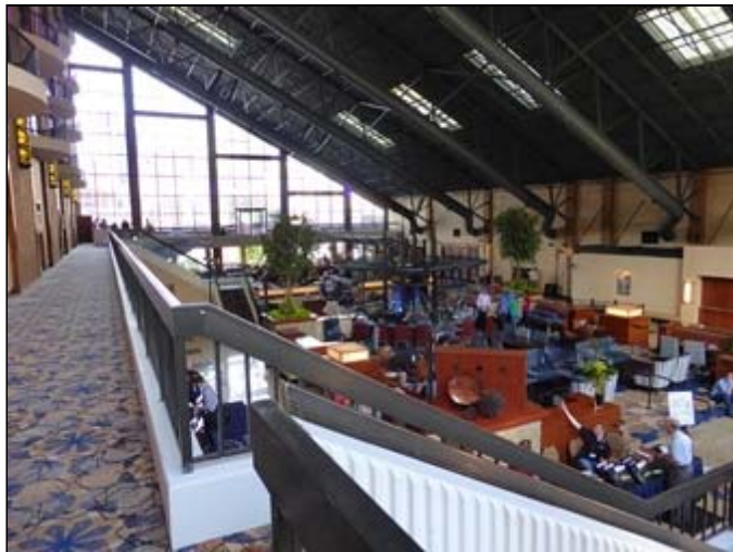
Lobby of Sheraton Pittsburgh Hotel at Station Square, from Mezzanine