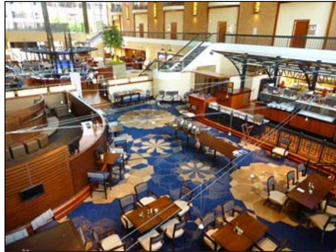
View of Main Lobby Floor at Hotel