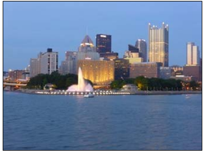
The Pointe, with Fountain Water from a Fourth River Underground