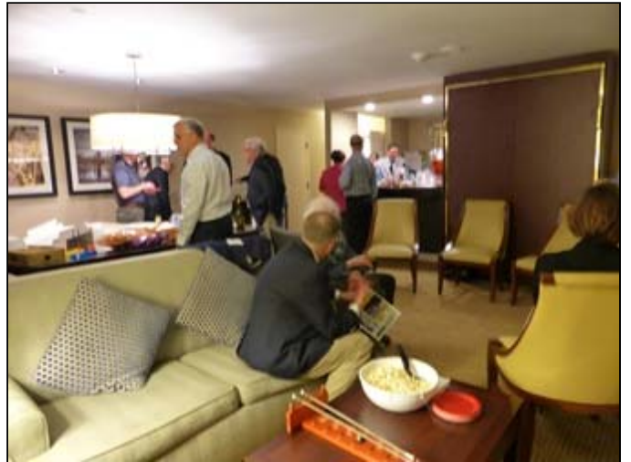
The Refreshments Were Expanded When a Group Across the Hall Brought Over Their Left Over Snacks and Drinks