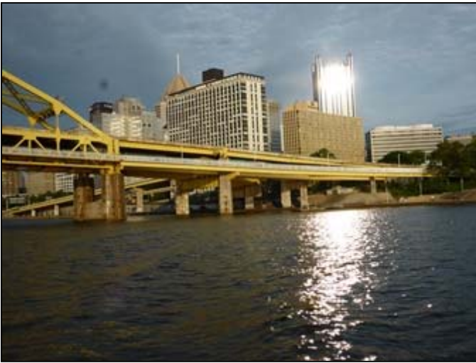
Reflection off the Phillip Johnson's PPG Building at Dusk