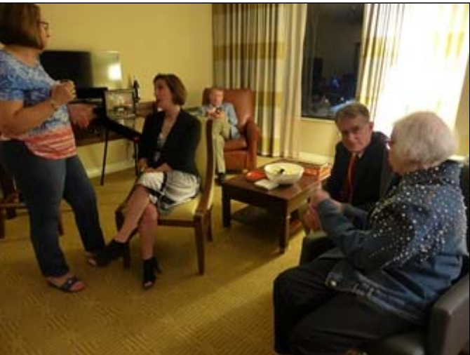
The Hospitality Room was Certainly Comfortable.