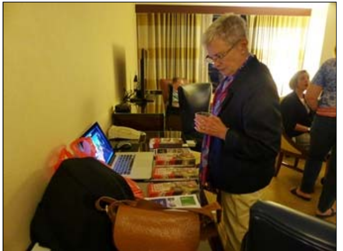
Visitor Viewing Winchester Video and Brochures.