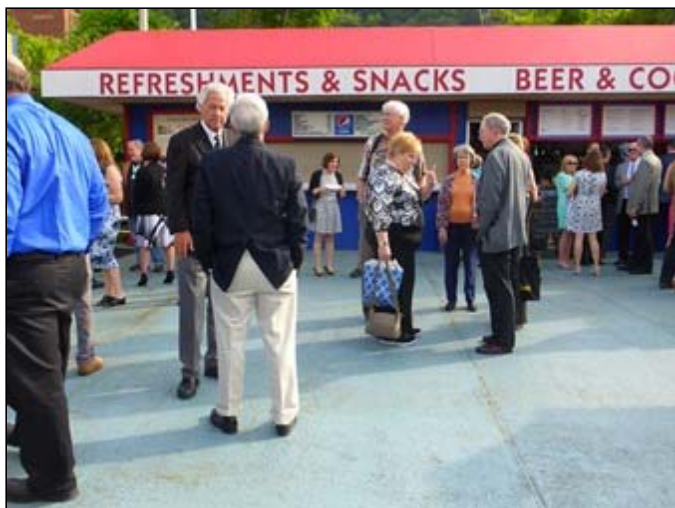
Dinner Guests at Marina Waiting to Board the Gateway Clipper Fleet Duchess River Cruiser