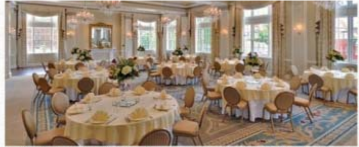
Ballroom of The George Washington, A Wyndham Grand Hotel in Winchester, Virginia

Winchester, Virginia MARC 2018 April 19-22, 2018