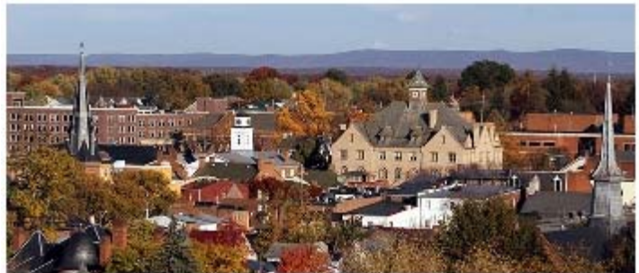
View of Winchester City Rooftops