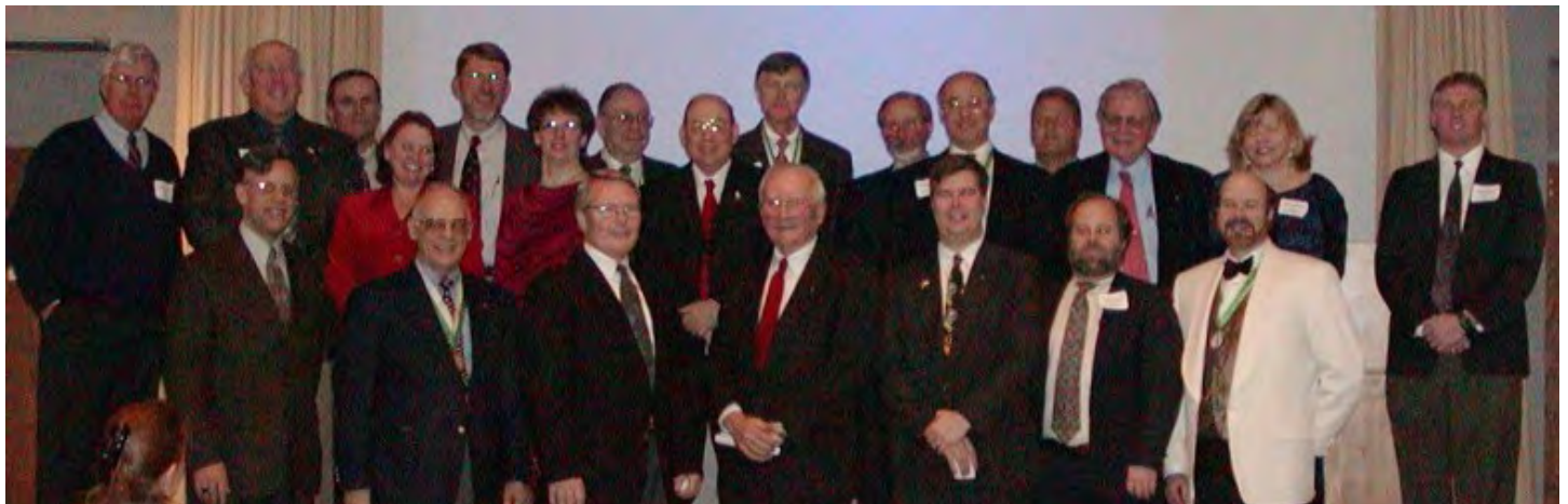
Out of the Attic — January 8, 2002 - Members attending 10th Anniversary Banquet at Washington National Cathedral