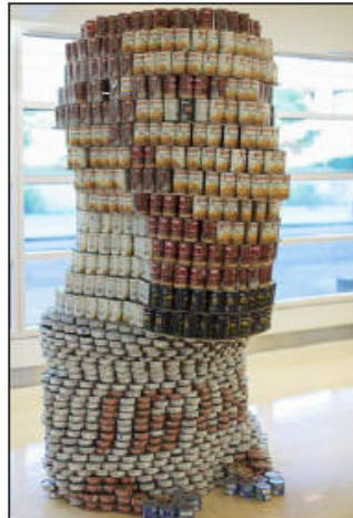
KGD Architecture -- Together We Can Strikeout Hunger

Abe Lincoln, hailing from the Corn Belt, Mr. Lincoln was known for being honest and virtuous. This likeness of him is made up of simple, hearty ingredients and staple foods found in the mid-west. Directions follow: